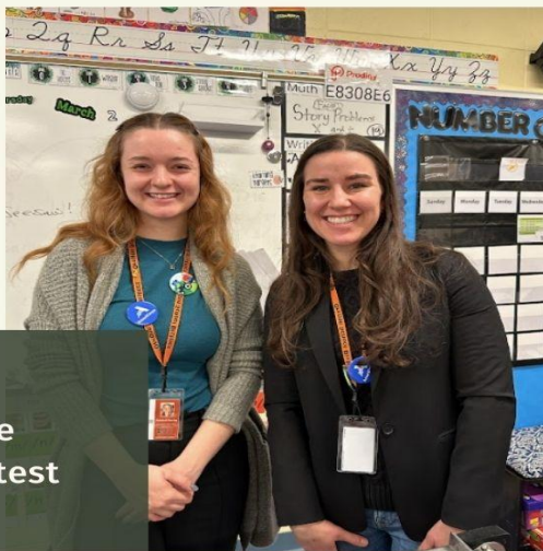
Feta cheese taste test